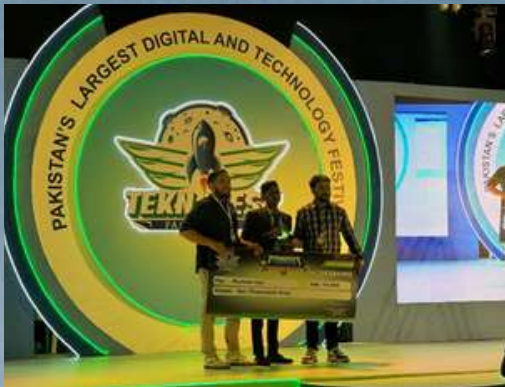
Winners of the PCB Designing Competition