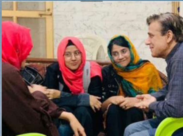
Students spending time with the elderly at Edhi Old Home