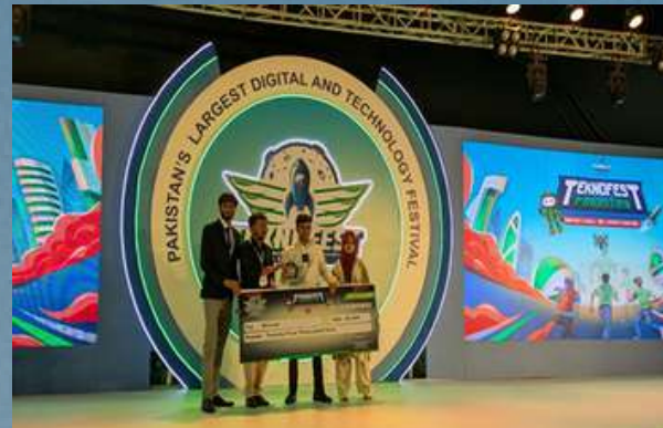
AI-Based Asthma Detection Project ranked among the Top 10