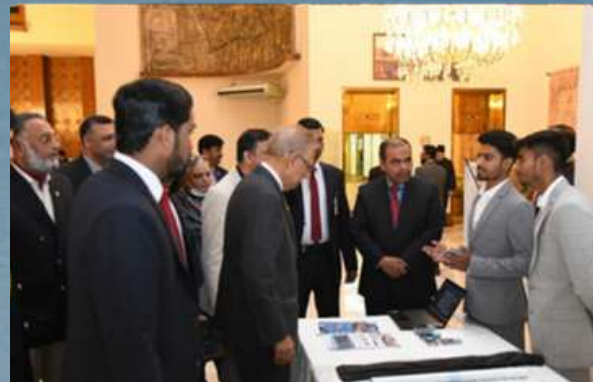
Students showcasing their project at the President's House