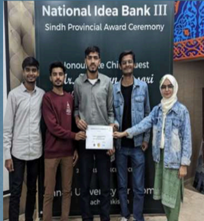
Students receiving award at the NIB event