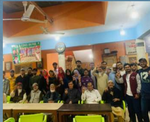
Students at Edhi Old Home