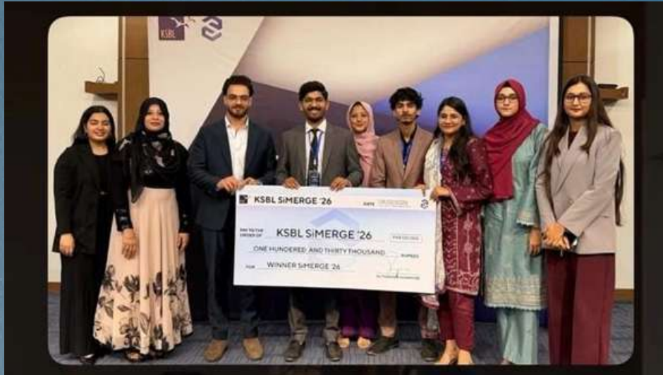
Team IIEE receiving the First Prize at KSBL Simerge 2026