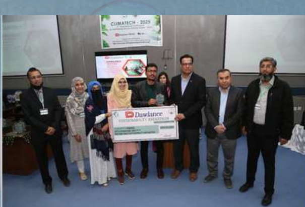
Final year IIEE students receiving the first-place award from the esteemed guests