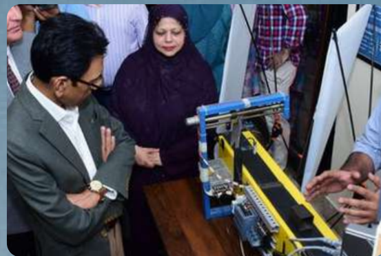
Student presenting his project to Minister of Science and Technology, Mr. Khalid Maqbool Siddiqui