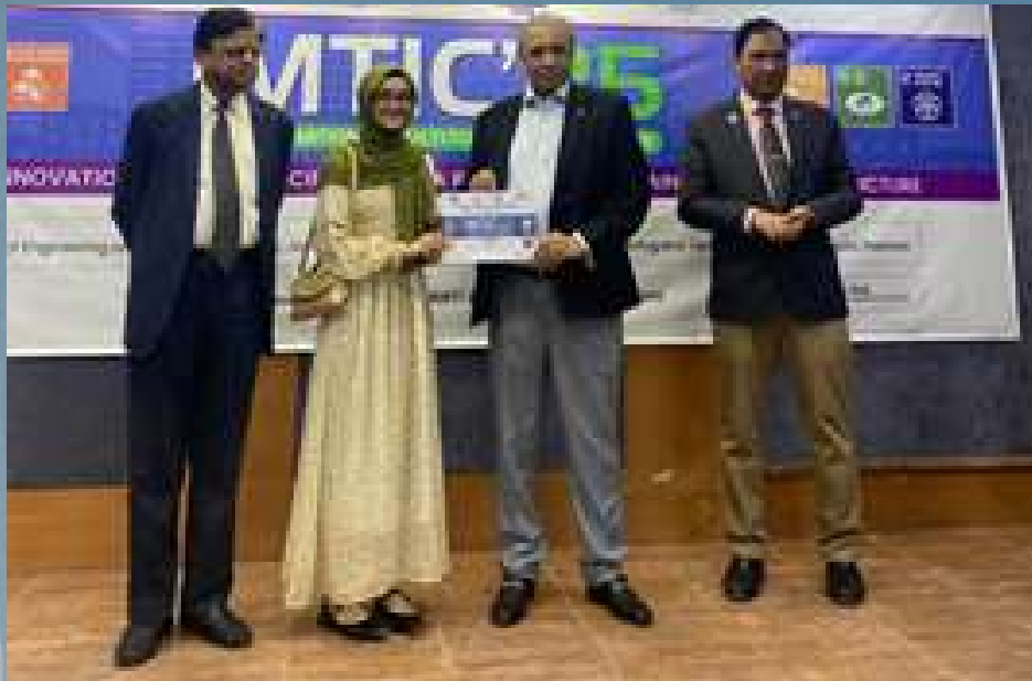
Student of Batch 2024 presented the paper in IMTIC 25