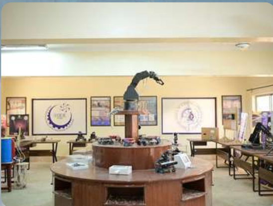
Final Year Project

IIEE student's Project Display Center was established at IIEE adjacent to the main building. Project display center is being utilized for the display of IIEE student's Final Year Design Projects (FYDP) to promote linkage and institute outreach among Industrial and Engineering Community