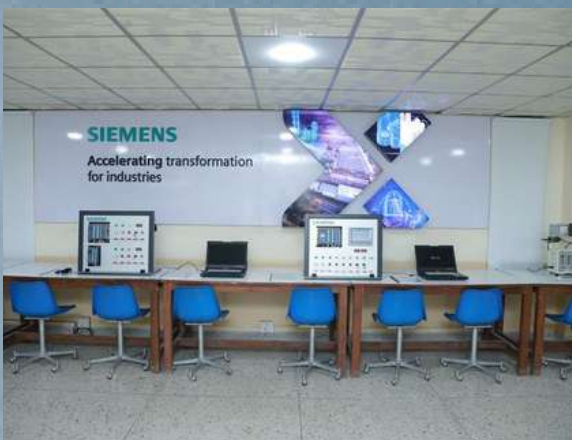
Industrial Automation Lab

In mostly Labs the complete set of equipment and tools are issued to the students on yearly basis.