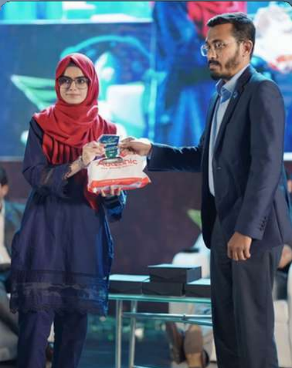
Student Won Pitching and Logo Competition at TEKNOFEST 2023