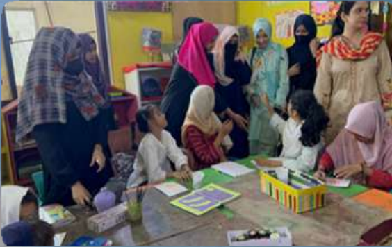
Students at Markaz e Umeed, Centre for Special Children