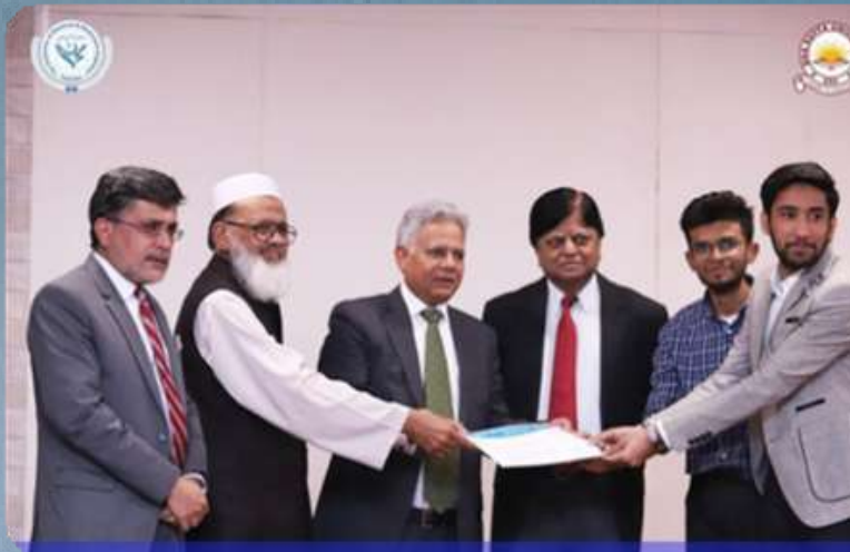
Students at the 38th IEEEEP All Pakistan Students 'Seminar 2023