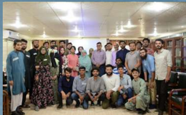
Embracing the Spirit of Entrepreneurship