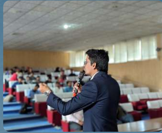
Session being conducted in the IIEE Auditorium