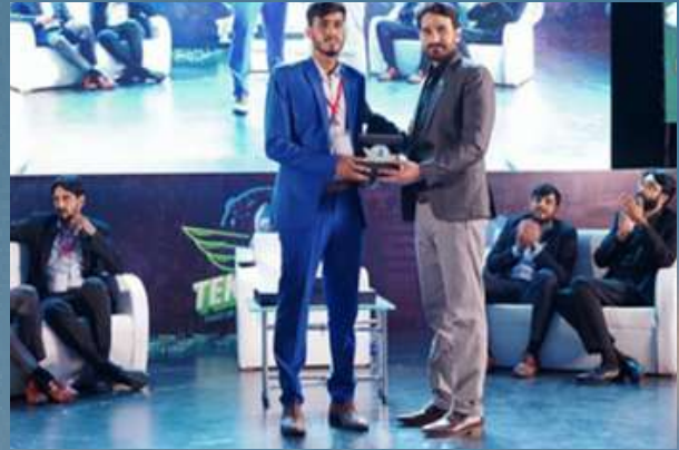
Students Awarded Gold Medal in 37t IEEE Multi-Topic Symposium