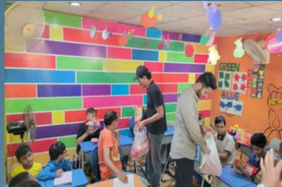
Students at Markaz e Umeed, Centre for Special Children