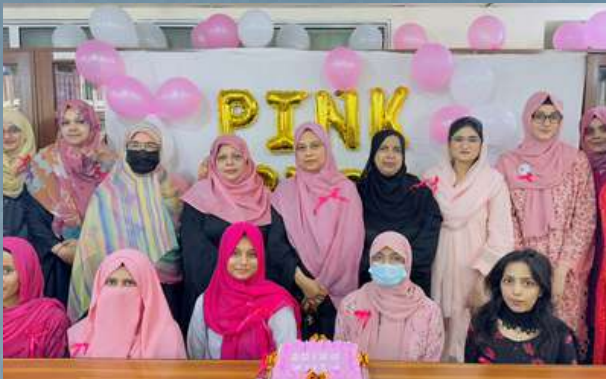
Embracing Empowerment: "Celebrating Pink Day at IIEE with the women Entrepreneur wing"