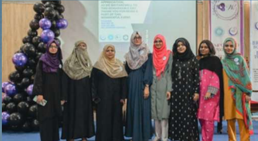
Optimistic Future, Event arranged by IEEE Women Branch