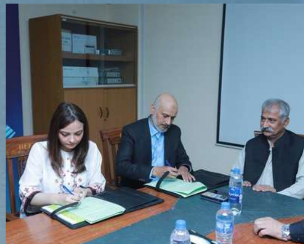
Principal, IIEE, and officials from Siemens Pakistan during the signing ceremony of the Memorandum of Understanding (MoU).