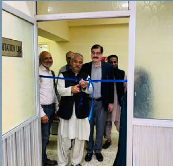
Vice Principal, IIIEE has also inaugurated computation lab