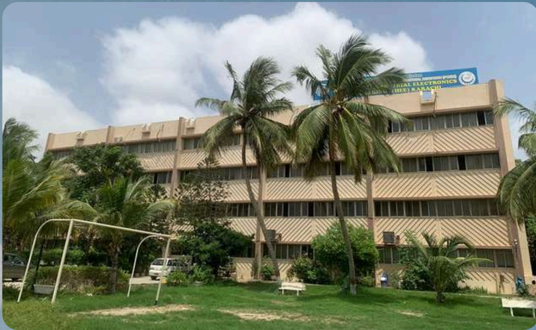
IIEE Academic Block

In addition to the main building, the premises of the IIEE include a mosque with a staff colony located adjacent to it.