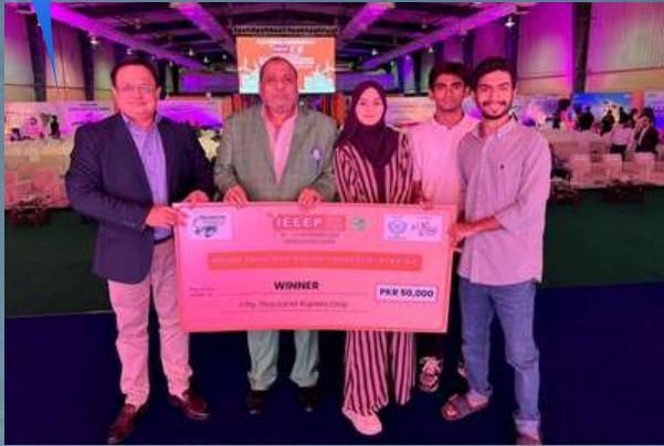
Chapioin Innovators: First Prize Winners “Smart Tech Exhibition at Expo Center” Karachi